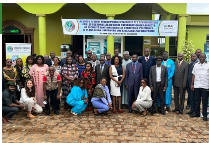
One Health representatives at integration workshop

Working with government, TDDA has developed guidance on how this integration can be achieved. We are delighted that this work was recently validated at a workshop involving a range of ministries. Key sector representatives are now fully aware of the benefits and ready to support this collective focus on health security.