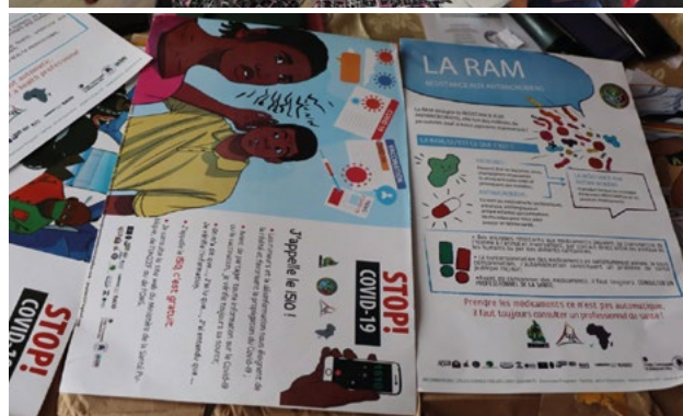
Photos (top to bottom): Crowds gather during CSO vaccination campaign, ROOHCAM presentation to potential partners, Materials produced following CSO workshops

TDDA's work in Cameroon is delivered with Centre Pasteur du Cameroun, in partnership with the Ministry of Public Health and Fondation Mérieux.