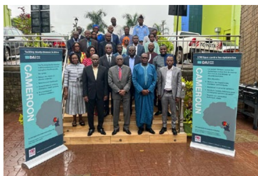
NOHP key sector representatives come together

The health of people, animals and the environment is closely interconnected. This is why strategies and actions to deal with public health threats are most effective when they are coordinated across a range of sectors, ministries and health actors. The formalization of a National One Health Platform (NOHP) is close to being achieved and will be a major milestone for health security in Cameroon. The platform is a crucial mechanism for driving multi-sectoral coordination. We are pleased to have supported its development and welcome the involvement of CSOs, who have been trained in health security, with our support. Now, by fully operationalizing the NOHP, Cameroon can further strengthen coordination and keep more people safe.