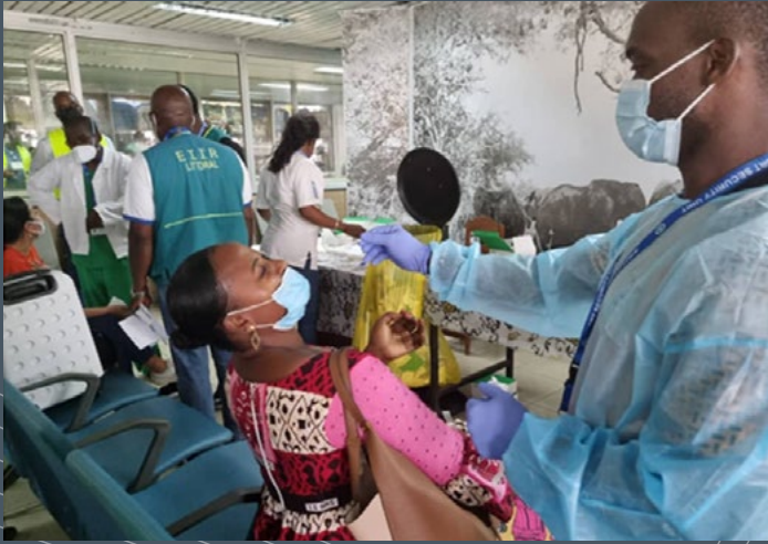
TDDA supported a health emergency simulation exercise at Douala Airport ahead of the Africa Cup of Nations (Dec 2021)